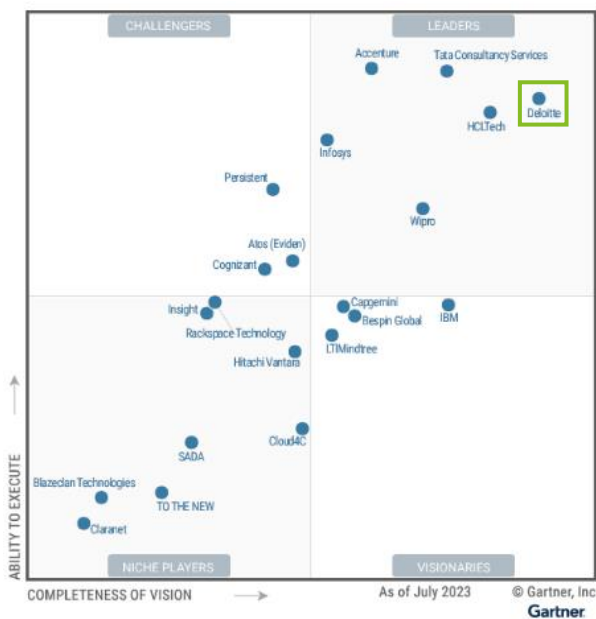
Gartner: Magic Quadrant for Public Cloud IT Transformation Services.

Originating in 2021, Deloitte has been recognised as a Leader in this category for three years in a row. Deloitte was also positioned as a Leader in the Gartner Magic Quadrant for Public Cloud Infrastructure Professional and Managed Services, Worldwide in 2021, 2020 and 2019.