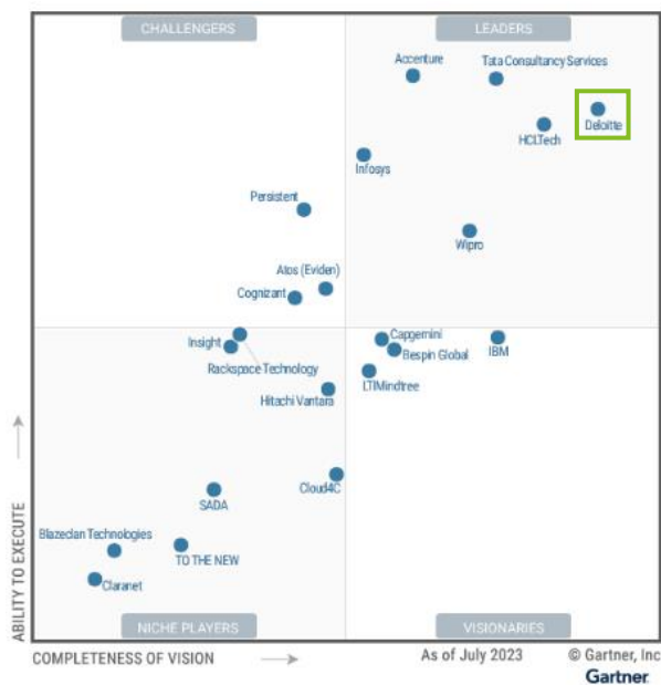
Gartner: Magic Quadrant for Public Cloud IT Transformation Services.

Originating in 2021, Deloitte has been recognised as a Leader in this category for three years in a row. Deloitte was also positioned as a Leader in the Gartner Magic Quadrant for Public Cloud Infrastructure Professional and Managed Services, Worldwide in 2021, 2020 and 2019.