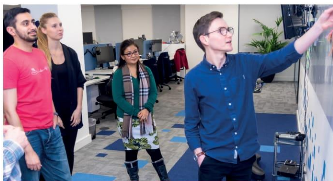
Our team are experts in delivering digital transformation projects within the public sector

Wherever you are on your digital journey, whatever the scale of your project or organisation, Fivium Digital has capabilities to help you achieve your transformation goals. We offer a range of services including end-to-end application lifecycle management: from design and development to on-going support and eventual refreshment, as well as specialist domain expertise and product assessments. We can also work with you to integrate your services to give you a single, coherent view of all your applications and business operations. With Fivium Digital, you get exactly what you need whilst being assured of a consistent, quality delivery that improves stakeholder value.