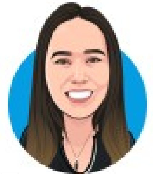
UK Team Leader