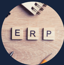
ERP Business Case Development