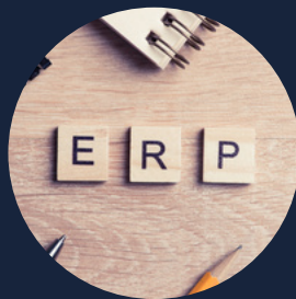
ERP Business Case Development