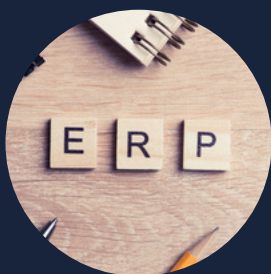
ERP Business Case Development